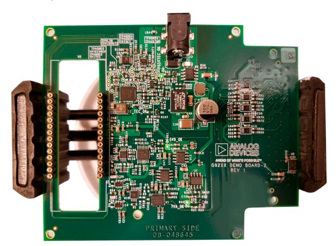
Figure 2. Top view of InGaAs array sensor interface board developed by Analog Devices.

These products demonstrate key characteristics of Analog Devices' highly integrated products, which include reducing BOM complexity and board space, performance optimization by eliminating board-level parasitics in critical circuits, and reducing system errors and uncertainty by providing performance specifications that encompass more of the signal chain. Additional high performance Analog Devices components are used to complete the AFE solution, including the ADR4550 precision voltage reference and the ADA4807 high speed precision amplifier. The AFE also provides the capability to synchronize the clocks of the LTM8053 and ADN8835 with the sampling clock that is provided to the sensor and ADAQ7980.