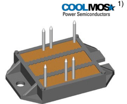
Pin arrangement see outlines