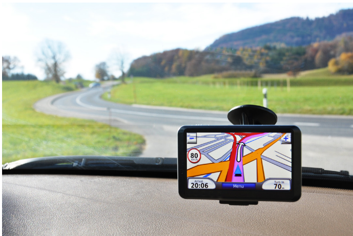
Figure 1. Like chronometers used in the late 1800s for marine navigation, today's satellite navigation systems help us find our way.

The basic principle of the GPS system is that radio signals are transmitted from satellites to receivers on or close to the Earth. The positions of the satellites at any given instant are known, and the distance or "range" from the receiver to each satellite can be calculated from the propagation delay of the radio signal from that satellite. Knowing the distance to each of several reference points (i.e., satellites) allows calculation of the receiver's spatial coordinates.