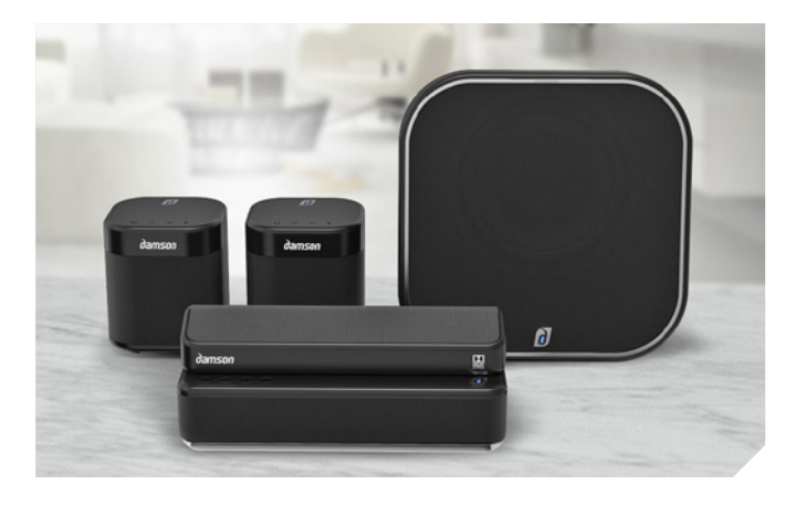
Figure 1. The compact, wireless S-Series from Damson Global runs the Dolby Atmos 3D audio codec.

To help Damson Global through the process of implementing Dolby Atmos in its new S-Series product, the company chose to partner with Analog Devices. This is the story of the S-Series development project, and the successful collaboration between the audio processing experts at Analog Devices and the world-class audio system designers at Damson Global (see Figure 1).