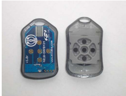
Figure 1. 4010 RKE Universal Key Fob and Plastic Case (P/N 4010-DAPB_434 and MSC-PLPB_1)