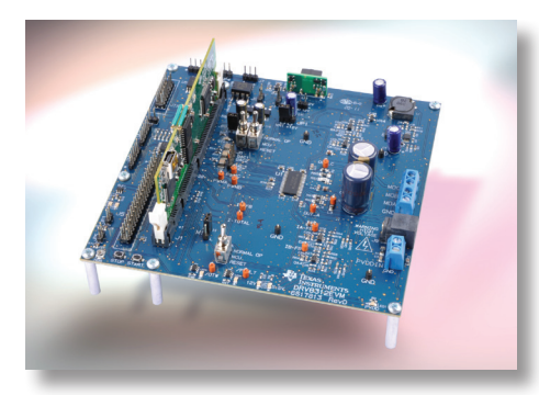
Medium Voltage Digital Motor Control Kit for Stellaris LM4F MCUs (DK-LM4F-DRV8312)

The operation of both solutions can be controlled and viewed across a USB interface using an included GUI. Follow the steps in the DK-LM4F-DRV8312 kit's README First document to quickly get up and running.