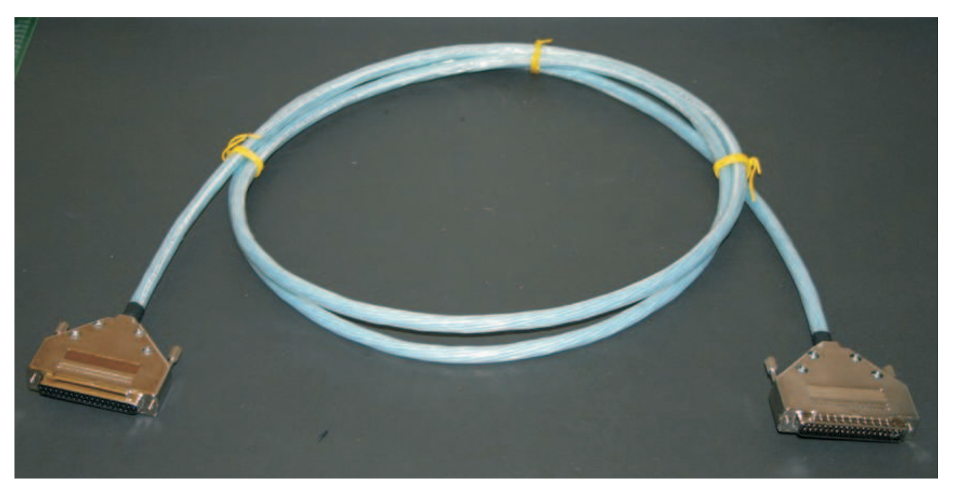
Figure 1. Multi-Cal-Interface Cable

Figure 1 shows the Multi-Cal-Interface cable. This cable is used to connect the master and slave boards to the interface board. This cable was designed so that it can be used in environmental temperature chambers (that is, from –55°C to +125°C). The length of the cable (8ft, or 2,438m) was selected to accommodate a majority of typical applications. If your application requires longer cables, you can build your own cable using the BOM provided at the end of this document.