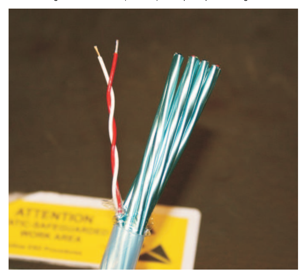
Figure 4. Cable Raw Materials

Figure 4 shows the raw material cable that is used in the construction of the Multi-Cal-Interface cable. This cable is rated to operate over the extended industrial temperature range (–55°C to +125°C). This cable contains 12 twisted-pair wires. Each twisted-pair is shielded with an insulated foil shield. Running adjacent to each foil shield is a bare drain wire. The drain wire provides a simple way to connect the foil shield to ground. The foil shield and twisted-pair configuration is helpful in reducing radio frequency interference/electromagnetic interference (RFI/EMI) noise pick-up on the signal connections.