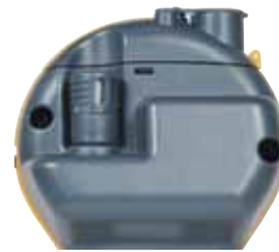
Quikstick ST POL78751, standard with all MMS2 kits and with the same performance as the standard Quikstick. A Quikstick ST can remain connected to the MMS 2 while using the pins.

Readings from multiple Hygrosticks can be taken and recorded with ease. Humidity readings can be taken with the use of humidity sleeves or humidity box. Hygrosticks, not Humisticks, should be used for this test.