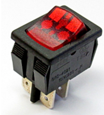
Item # GRL-4021-0012, 4000 Series Illuminated Miniature Rocker Switches

Email: info@cwind.com • Website: http://www.cwind.com