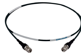
CASE STYLE: RG2513-2