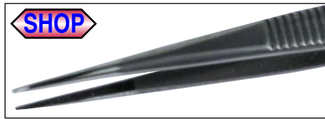
Tapered to Fine Tip Serrated