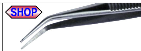
Bent Fine Tip & Serrated