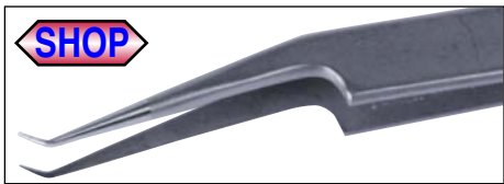
Fine Points Angled with 40° - Tip Bend