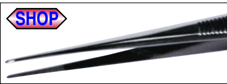
Long Tapered to Fine Tip Serrated