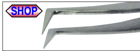
Fine Hooked & Tapered Tips