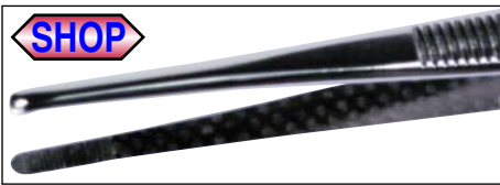
Blunt Tip Serrated