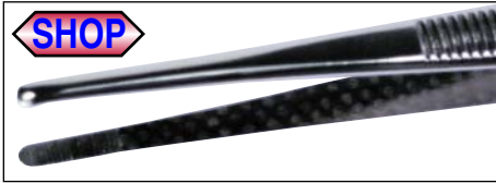
Blunt Tip, Serrated