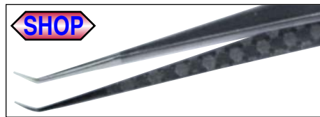
Narrow Body Low Force Bent 35° - 3mm Long Tip