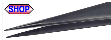
Strong Tweezers Tapered To Point