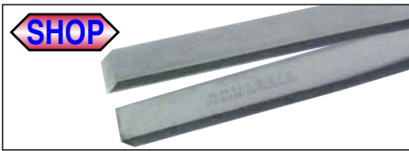
Heavy Duty Forming Tweezers