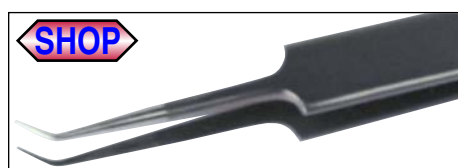
Extra Fine Points Bent 30° 3mm Long Tip