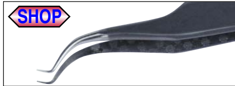
Curved Extra Fine, 3mm Long Angled Tip