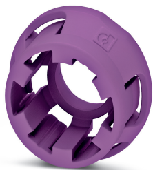
Fixing sleeve for M12 housing screw connection with tolerance-compensating function, for SMD-solderable M12 socket contact inserts.

Please be informed that the data shown in this PDF Document is generated from our Online Catalog. Please find the complete data in the user's documentation. Our General Terms of Use for Downloads are valid ( http://phoenixcontact.com/download )