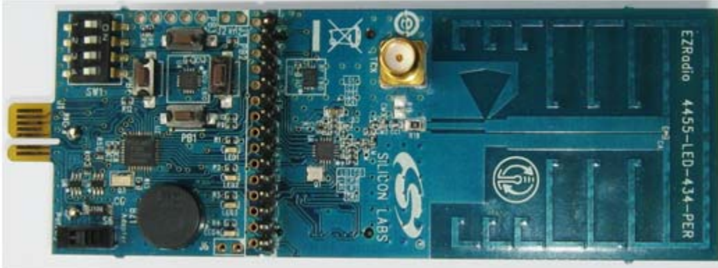
Figure 1. Si4455 RFStick 434 MHz Transceiver Board (P/N 4455-LED-434-PER)