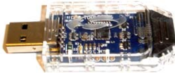
Figure 2. Toolstick Base Adapter (P/N Toolstick_BA)

For more information on using the RFstick and the Toolstick Base Adapter together to develop your own application please refer to the "AN692: Si4355/Si4455 Programming Guide and Sample Code."