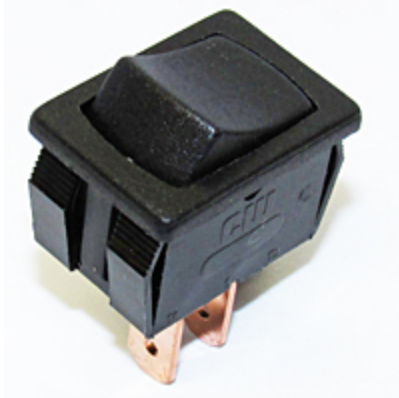
Item # GRS-4011C-0002, 4000 Series Momentary Miniature Rocker Switches

Email: info@cwind.com • Website: http://www.cwind.com