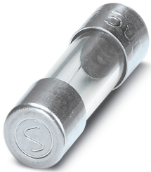
Security, idle, 2.5 ampere

Please be informed that the data shown in this PDF Document is generated from our Online Catalog. Please find the complete data in the user's documentation. Our General Terms of Use for Downloads are valid ( http://phoenixcontact.com/download )