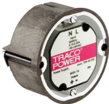
(Mounted in standard flush box)

The TIW series is a new range of small size DC-power supplies which have been designed particularly for applications in home and office installations.