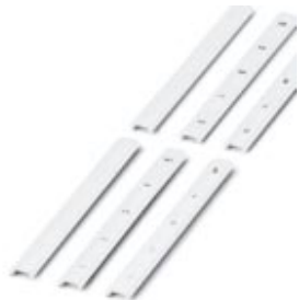
Zack marker strip, 10-section, horizontally labeled with the consecutive numbers: 91 ... 100, white

Please be informed that the data shown in this PDF Document is generated from our Online Catalog. Please find the complete data in the user's documentation. Our General Terms of Use for Downloads are valid ( http://phoenixcontact.com/download )