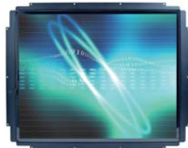
Open Frame Type