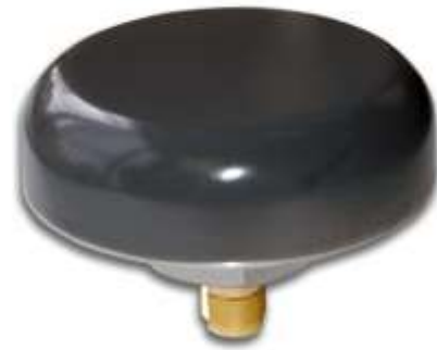
TW3101 Dimensions (mm) Low Profile Radome shown. Conical Radome also available

The TW3101 is housed in a permanent mount industrial-grade weather-proof enclosure and two options for pole mounting are available an L-bracket (P/N#23-0040-0) or a pipe mount (P/N#23-0065-0).