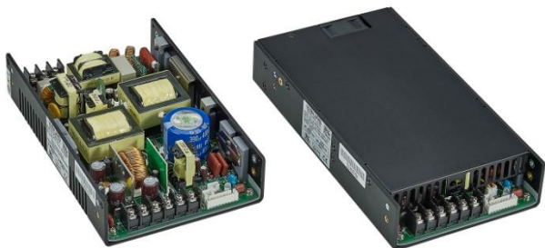
RL0402DU Series (U-Chassis Type): 8(L) x 5(W) x 1.6(H) inches. RL0402DE Series (Enclosed Type): 9(L) x 5(W) x 1.6(H) inches.