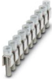
Fixed bridge, Number of positions: 10, Color: silver

Please be informed that the data shown in this PDF Document is generated from our Online Catalog. Please find the complete data in the user's documentation. Our General Terms of Use for Downloads are valid ( http://download.phoenixcontact.com )