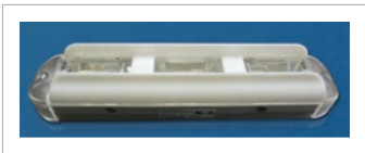
FlareShield™ on module