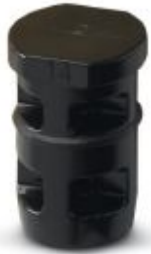
Filler plugs, length: 20 mm, diameter: 15 mm, color: black

Please be informed that the data shown in this PDF Document is generated from our Online Catalog. Please find the complete data in the user's documentation. Our General Terms of Use for Downloads are valid ( http://phoenixcontact.com/download )