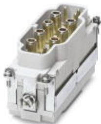
HEAVYCON pin insert, K6/6 series, for 6 power and 6 control contacts and PE, axial screw connection (power contacts)/screw connection (control contacts)

Please be informed that the data shown in this PDF Document is generated from our Online Catalog. Please find the complete data in the user's documentation. Our General Terms of Use for Downloads are valid ( http://phoenixcontact.com/download )