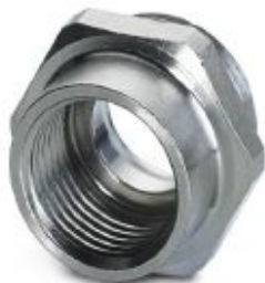
Housing screw connection with M12 standard thread, with O-ring, for 2-piece K, L, and M-coded THR contact carriers

Please be informed that the data shown in this PDF Document is generated from our Online Catalog. Please find the complete data in the user's documentation. Our General Terms of Use for Downloads are valid ( http://phoenixcontact.com/download )