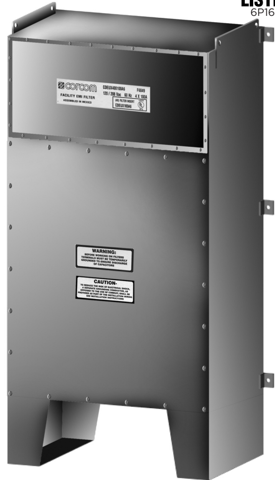
Shown with optional legs