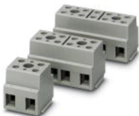
Device terminal block, for direct mounting, 5-pos.

Please be informed that the data shown in this PDF Document is generated from our Online Catalog. Please find the complete data in the user's documentation. Our General Terms of Use for Downloads are valid ( http://phoenixcontact.com/download )