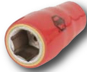
Inch - 6 Point