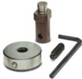
Stamping bit, for bore holes: 4.3 mm diameter

Please be informed that the data shown in this PDF Document is generated from our Online Catalog. Please find the complete data in the user's documentation. Our General Terms of Use for Downloads are valid ( http://download.phoenixcontact.com )