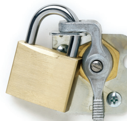
24505 & 24505-01 Lockout Lever Kit