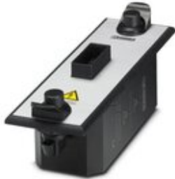
CHECKMASTER 2 test adapter for the PT and PLT-SEC product ranges, 17.5 mm

Please be informed that the data shown in this PDF Document is generated from our Online Catalog. Please find the complete data in the user's documentation. Our General Terms of Use for Downloads are valid ( http://phoenixcontact.com/download )