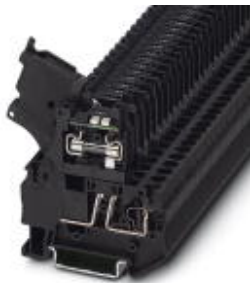
Lever-type fuse terminal block, black, for 5 x 20 mm G fuse inserts, with LED for 24 V DC

Please be informed that the data shown in this PDF Document is generated from our Online Catalog. Please find the complete data in the user's documentation. Our General Terms of Use for Downloads are valid ( http://phoenixcontact.com/download )