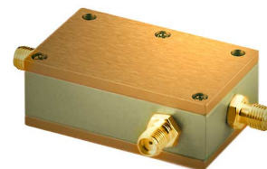
CASE STYLE: FM587 PRICE: $49.95 ea. QTY (1-9)