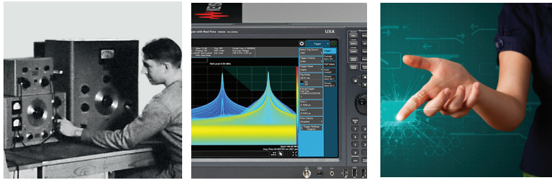
From Hewlett-Packard to Agilent to Keysight

Our unique combination of hardware, software, support, and people can help you reach your next breakthrough. We are unlocking the future of technology.