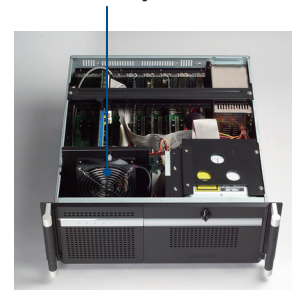
Easy-to-maintain system fan