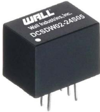
Size: 0.56in x 0.36in x 0.40in (14.2mm x 9.1mm x 10.2mm)