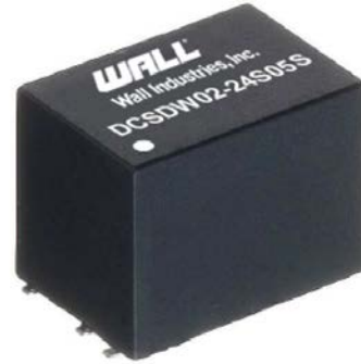
Size: 0.52in x 0.36in x 0.40in (13.2mm x 9.1mm x 10.2mm)