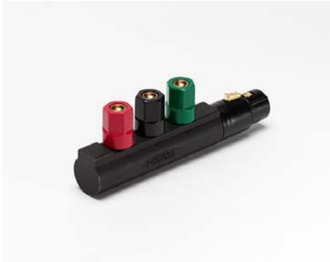
Model 7287 XLR (F) / Triple Binding Post