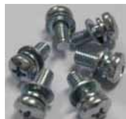
Screws for the Whole Module