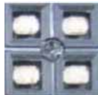
Pixel: RGB 0505 SMD LED