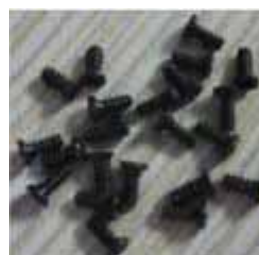
Screws for the Module Cover