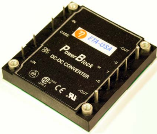
Size: 60.70mm x 57.91mm x 13.30mm (2.39in. x 2.28in. x 0.52in.)