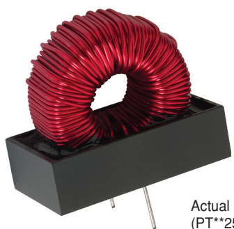
Actual Size (PT**25-894VM)