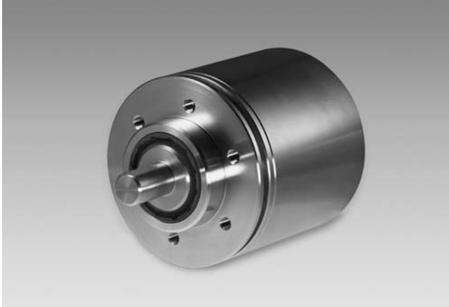
X 700 with EX-proof housing