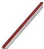
Continuous plug-in bridge, length: 500 mm, color: red

Continuous plug-in bridge - FBST 500-PLC RD - 2966786