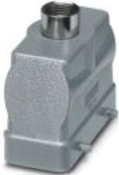
HEAVYCON B16 sleeve housing, for double locking latch, height: 76 mm, with 1 x Pg29 gland, straight cable outlet

Please be informed that the data shown in this PDF Document is generated from our Online Catalog. Please find the complete data in the user's documentation. Our General Terms of Use for Downloads are valid ( http://download.phoenixcontact.com )