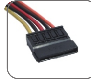
S-ATA Connector x 2