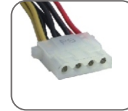
4pin Peripheral Connector x 5