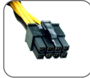
8 pin+12V CPU Connector x1