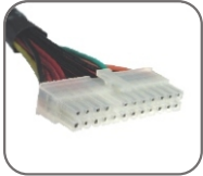
20+4pin Motherboard Connector x 1