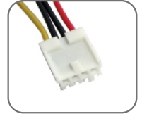
4 pin Floppy Connector x 1