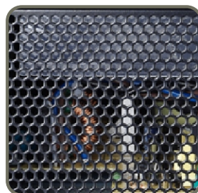
Ventilation channels enhance cooling efficiency