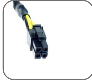
4 pin+12V CPU Connector x1