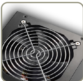
Tiny noise 120mm fan