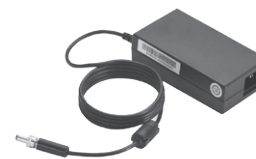
▲ AC power adapter (GOT5152T-832-J)