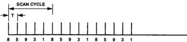
Figure 1. Normal Scan Mode

The normal mode allows you to specify the time "T" between each channel in the scan list. The on-board pacer source initiates each conversion when the time "T" is elapsed. The channels are read in the user-defined sequence until the user-specified number of conversions (count) is completed. Figure 1 shows how normal scan works on a scan list with five channels and a user-specified count of 15. The scan cycle time is derived from the number of channel entries in the scan list multiplied by the time "T" between conversions.