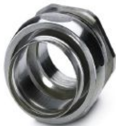
Cable gland made from brass with metric thread, IP40 protection

Please be informed that the data shown in this PDF Document is generated from our Online Catalog. Please find the complete data in the user's documentation. Our General Terms of Use for Downloads are valid ( http://phoenixcontact.com/download )