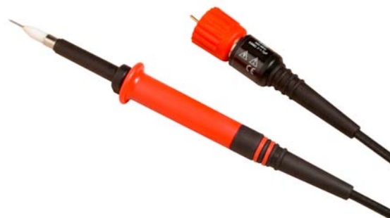
Model 6498 1000V CAT II Passive Oscilloscope Probe