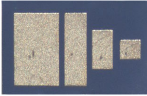
Product may not be to scale

The CBA MOS capacitor chips each contain four different capacitors in binary increments allowing the user many choices in value selection. Two versions of CBA capacitors are available: one with a total capacitance of 3.75 pF and one with a total capacitance of 15 pF.