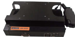
ARK-DS303 with standard mounting bracket